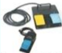
Monopolar Double Pedal Foot switch / Bipolar Single Pedal Foot switch