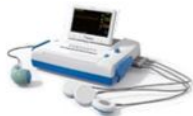
BISTOS Fetal Monitor