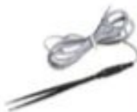
Bipolar Forcep with Cable Autoclavable