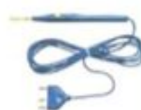
Disposable Hand Switch Pencil - Imported