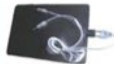
Patient Plate with Cord Autoclavable