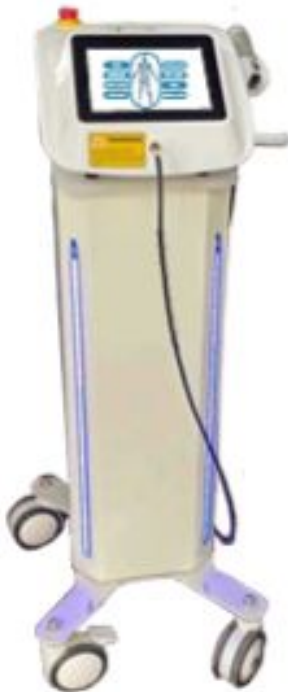
LASER CLASS IV