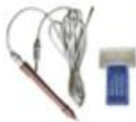
Chunk Handle with Electrodes Autoclavable